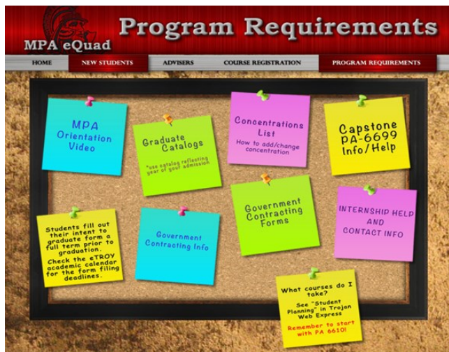
Program Requirements Page

If you would like to review any of the program requirements, click on the many areas to review.